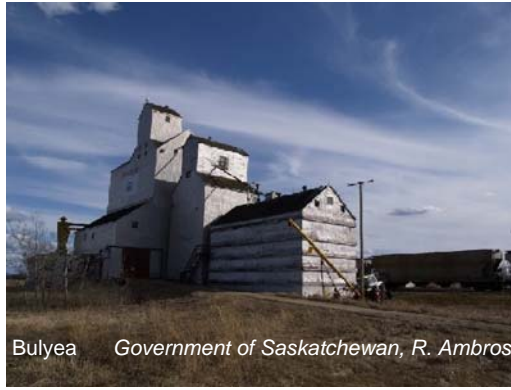
Bulyea Government of Saskatchewan, R. Ambrosi